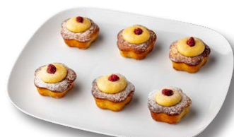
Raspberry & Passionfruit

A flavoursome cake made with freshly grated carrot and toasted walnuts, garnished with compulsory rich cream cheese, chopped apricots and pumpkin seeds