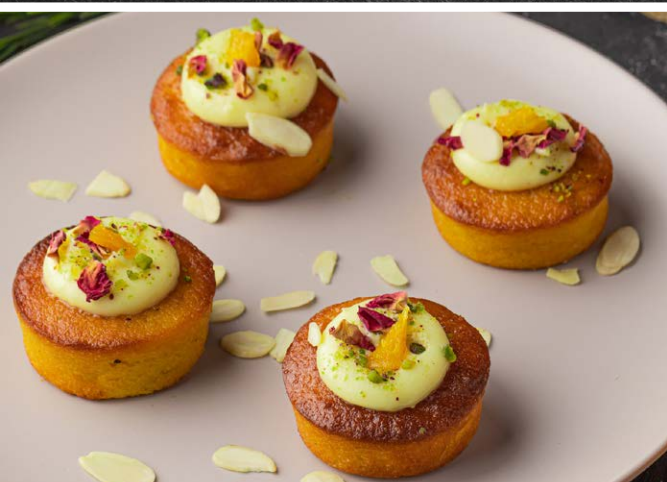
Orange & Almond Mini Cake

Now available! A range of your trusted favourites in mini, canape sizes to complete your catering, high tea's, buffet's and function menu's. Sold in packs of 12 per flavour.