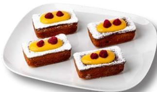
Raspberry & Passionfruit Cake

Golden moist cake made with fresh whole oranges and almonds, garnished with cream cheese icing, candied orange, pistachios and dried rose petals.