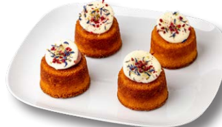
Lychee & Strawberry Cake

Tangy cake folded with yoghurt and dipped in fresh lime syrup, garnished with coconut cream icing, shaved coconut and dried flowers.