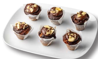
Banana, Hazelnut & Nutella

Hazelnut meal muffin base mixed with fresh banana and topped off with Nutella, banana chips and white chocolate crumbs.