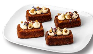
Fig & Apple Cake

Fresh date and pecan cake garnished with an espresso cream cheese icing, chocolate crumbs, roasted pecan nuts and dates.