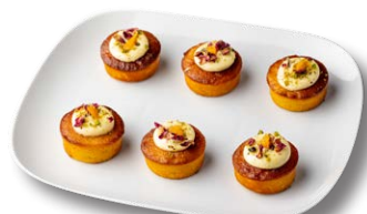
Orange & Almond

Golden moist cake made with fresh whole oranges and almonds, garnished with cream cheese icing, candied orange, pistachios and dried rose petals