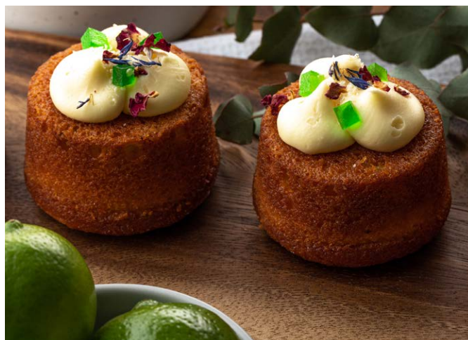
Lime, Yoghurt & Coconut Cake

A flavoursome cake made with freshly grated carrot and toasted walnuts, garnished with compulsory rich cream cheese, chopped apricots and pumpkin seeds.