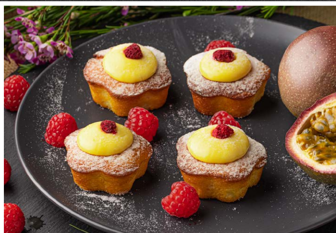
Raspberry & Passionfruit Mini Cake