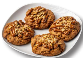
Banana Bread, Dulce De Leche & Walnut

We've taken cookies to the next level. Our range of Loaded Cookies are just that, generously stuffed with chunks of goodness. Crisp and chewy with a gooey centre. A must have treat for the ultimate cookie lover! Cookies are best stored ambient in airtight container. Sold in Packs of 6 per flavour.