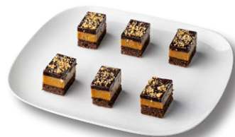
Chocolate, Salted Caramel & Hazelnut

Hazelnut friand base, topped with rich buttery salted caramel, couverture chocolate and roasted hazelnuts, very addictive