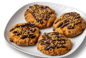
Nutella, Choc Chip & Hazelnut

Shortbread cookie bursting with macadamia nuts, white chocolate chips and stuffed with our signature salted caramel. Garnished with white chocolate drizzle and crushed macadamia nuts.