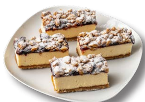
Cherry Crumble Cheesecake

Using only the finest of ingredients our slices are superior in texture, moist, delectable and bursting with flavour. These are an absolute must have.