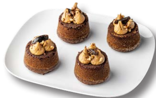
Date, Pecan & Espresso Cake

Rich and moist cake containing Callebaut chocolate filled with sweet cherries and soaked in a Kirsch syrup then garnished with a light cream cheese icing, freeze dried cherries and chocolate crumbs.