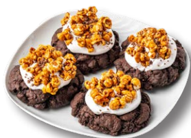
Chocolate, Marshmallow & Caramel Popcorn

Soft chewy cookie made with real bananas, stuffed with chunky walnuts, banana chips and filled with the sweet goodness of dulce de leche. Topped with lashings of dulce de leche and crushed walnuts.