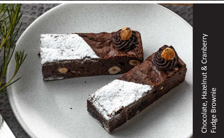
Chocolate, Hazelnut & Cranberry Fudge Brownie