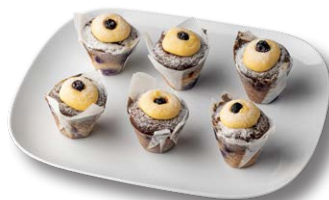
Blueberry & Lemon

Hazelnut meal muffin base mixed with fresh banana and topped off with Nutella, banana chips and white chocolate crumbs.