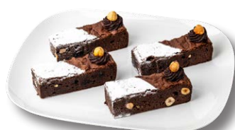
Chocolate, Hazelnut & Cranberry Fudge Brownie

Butter biscuit base, baked cheese cake filling, topped off with cherry compote, baked crumble and dusting sugar.