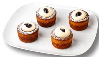
Lemon & Blackcurrant Cake

Rich tasting cake made with fresh bananas and pineapple, garnished with orange cream cheese icing, banana chips, walnuts and dried flowers