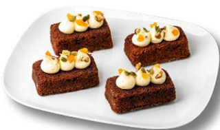
Spiced Carrot & Walnut Cake

A delicious vanilla bean cake filled with tangy sweet raspberries garnished with a passion fruit curd and freeze dried raspberries and a sprinkle of icing sugar.