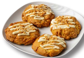
Macadamia, White Chocolate & Caramel

A rich and indulgent chocolate cookie stuffed with dark chocolate chips, topped off with homemade marshmallow and garnished with a generous amount of salted caramel honey popcorn and chocolate crumbs.