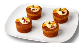
Orange & Almond Cake

Fresh lychee flavoured cake garnished with a strawberry cream cheese icing, a white chocolate disk, pistachios, freeze dried strawberry and dried flowers.