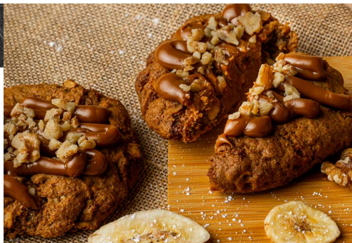
Banana Bread, Dulce De Leche & Walnut