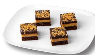
Chocolate, Salted Caramel & Hazelnut

A rich fudgy moist Belgium chocolate brownie filled with cranberries, roasted hazelnuts and topped off with a chocolate cream cheese swirl.