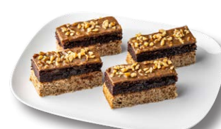
Mocha & Walnut

Hazelnut friand base, topped with rich buttery salted caramel, couverture chocolate and roasted hazelnuts, very addictive.