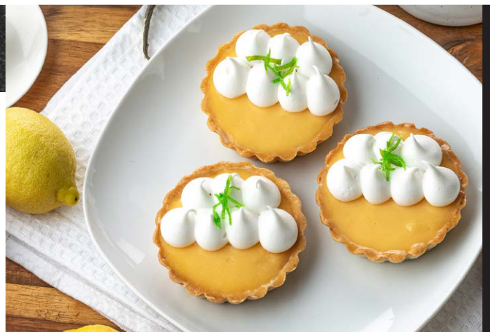
Citrus Meringue Tart