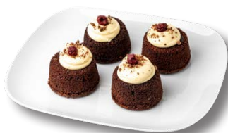
Black Forest Cake

Our signature range of individual desserts are sure to bring joy to your customers. We have paired modern and unique flavour combinations to create refreshing, light and moreish individual desserts. All topped and decorated with Chef Daniel's signature flair. Elevate your pastry cabinets by combining a variety of these to create a gallery of treats your customers can not refuse.