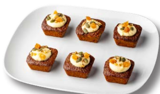
Spiced Carrot & Walnut

Golden moist cake made with fresh whole oranges and almonds, garnished with cream cheese icing, candied orange, pistachios and dried rose petals