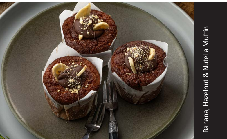
Banana, Hazelnut & Nutella Muffin

All of our products are sold in packs of 6. Please visit our website for ordering & delivery details or call us today!