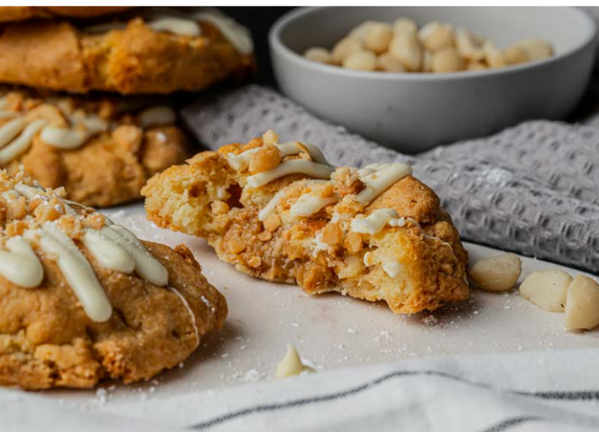
Macadamia, White Chocolate & Caramel