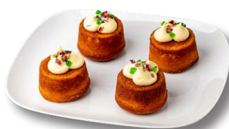
Lime, Yoghurt & Coconut Cake

Fragrant lemon flavoured cake filled with tangy blackcurrant and garnished with cream cheese icing and a sweet blackcurrant compote.